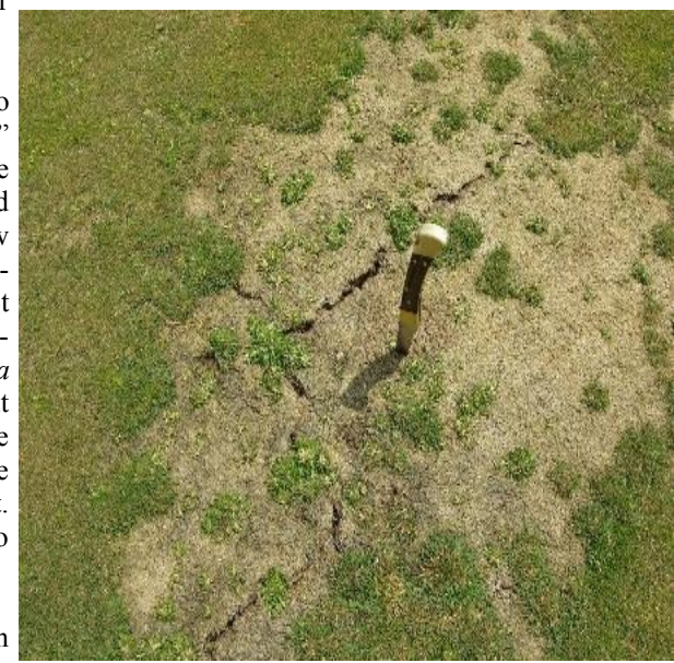
We have been dry and managing the soils on the dry side is a good thing. However, establish a baseline this spring for irrigation. Don't allow the turf to become compromised as we prepare for the summer ahead.

We have had confirmations of adult annual bluegrass weevil activity in portions of our region. Make every effort to wait until a consistent migration of adults occurs to implement control strategies. Use the calendar as guide but do not allow a penciled date on the calendar to dictate when the pest control is enacted. Missing the window of control for annual bluegrass weevil will only add to the potential stress that could severely damage weakened Poa annua.